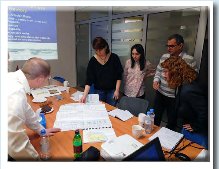
Figure 5. Groundwater modeling was discussed with our Armenian partners as a useful tool to help manage groundwater resources in the Ararat Basin. Here, the group discussed generalization of geologic units using available lithologic logs for purposes of groundwater modeling.

The USGS will develop a hydrogeologic framework for the Ararat Basin to support the development of a groundwaterflow model. A model will permit the simulation of changes in discharge rates from wells (such as benefits of sealing abandoned wells) and changes in basin recharge rates (such as drought conditions). Characterization of the artesian aquifer will include areal extent, thickness, depth, water levels, flowing and nonflowing conditions, and recharge and discharge rates. In addition, Interferometric Synthetic Aperture Radar (InSAR) imagery will be used to determine if land subsidence has occurred or is occurring due to groundwater depletion.