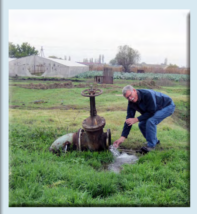
Figure 3. An abandoned well in the Ararat Basin flowing water to the land surface in November 2015.

The objectives for this study are to (1) characterize the hydrogeologic framework and conditions in the Ararat Basin; (2) summarize groundwater resources in the Ararat Basin and provide technical assistance to design a groundwater monitoring network; (3) and provide technical workshop(s) to build expertise in country to understand and manage groundwater resources. Characterization of the hydrologic framework will be through existing geologic maps, remote sensing imagery, well records and logs, and groundwater-level measurements collected in the Ararat Basin by in-country partners. Critical data gaps based on the hydrologic framework will be identified to assist in developing key components of a groundwater monitoring network. In-country hydrology professionals, the USGS, and USAID will outline a plan for sustainable groundwater use in the Ararat Basin.