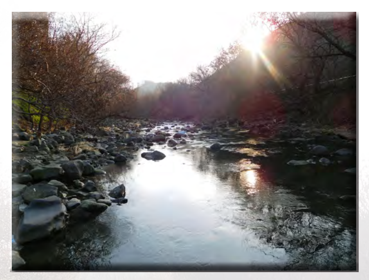
Figure 7. Hrazdan River at Yerevan, Armenia, where water samples were collected for analysis of select stable isotopes and cesium-137.

Figure 6. Field training on March 2, 2016, on the collection of hydrologic data. A , Collection of water-level data from a nonflowing well near Ararat, Armenia (Mt. Ararat is in background); B , collection of water-level data from a flowing well near Masis, Armenia; C , measurement of well discharge from a nonflowing well near Artashat, Armenia.