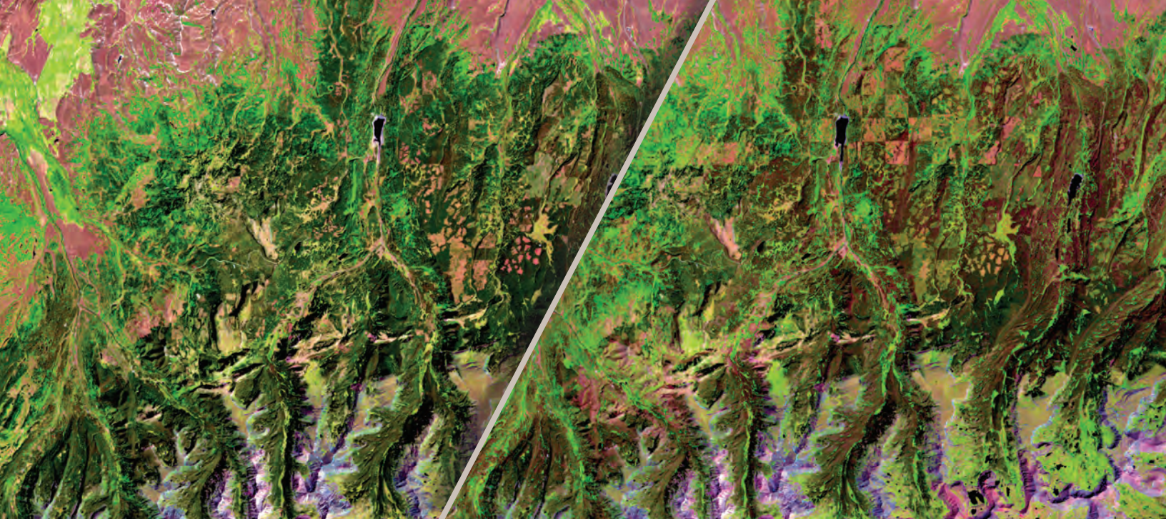
Figure 1. Landsat time-series satellite imagery captured this dramatic assault of mountain pine beetles on forest land in the Uinta Mountains east of Salt Lake City, Utah. In the August 1992 image at left, the shades of dark green indicate areas of healthy, undisturbed forest. At right in 2010, the dark red stains reveal widespread pine beetle destruction.

Such was the vision of Secretary of the Interior Stewart Udall 50 years ago when he boldly called for Earth observations from space. What the U.S. Geological Survey has accumulated now (2016) are vast and continuous long-term records from Landsat that have become critical tools for agencies such as the U.S. Forest Service (Forest Service), which reports on the status and health of forest resources in the Nation.