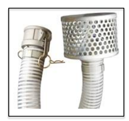
Figure 1.1. 2-inch suction hose with camlock adapter (left) and strainer cage with 3/8-inch holes (right).

Although two people can effectively use this set up, we found that three people worked best: one to run the boat, one to handle the hose, and a third to help keep the intake clear and point out egg masses for the hose person. If the floating and (or) submerged vegetation was thick, we had to stop more often to reposition and clear the intake hose with strainer.