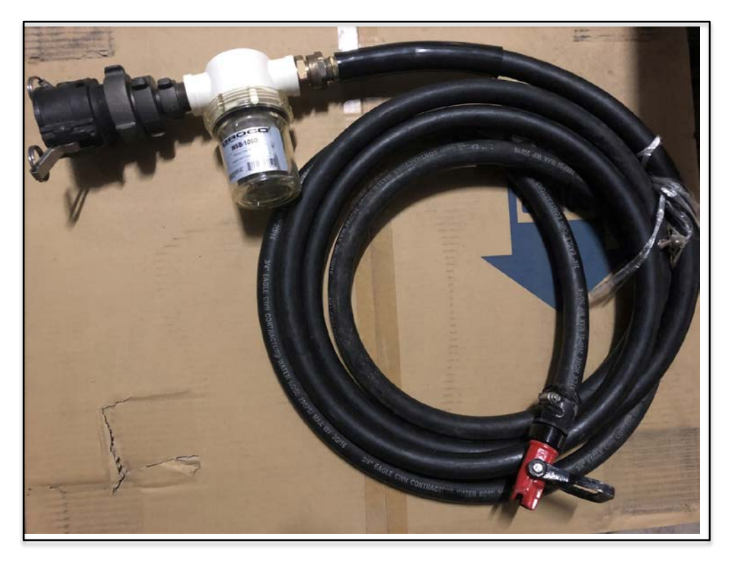
Figure 1.2. Spray hose setup with adapters, inline filter, 3/4-inch garden hose and spray nozzle.