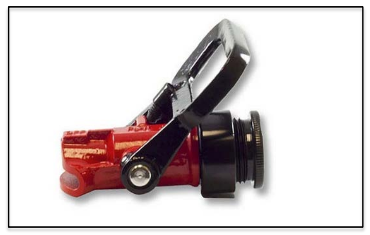
Figure 1.3. Aluminum adjustable fan stream nozzle (garden hose thread / 1-inch national pipe straight hose thread)