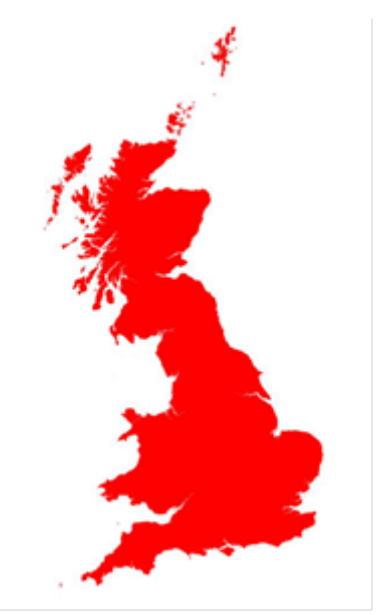
Figure 1 - Coverage of GeoClimate Basic