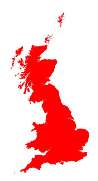
Figure 2 - Coverage of GeoClimate Premium

The GeoClimate products are national scale datasets covering Great Britain. The extent of the GeoClimate Premium shrink-swell layer is shown in Figure 2.