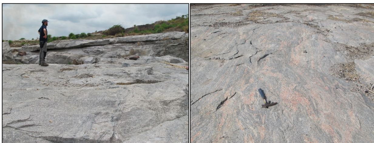
Figure 6: Massive to weakly foliated late-tectonic granitoids in the quarry at Makeni, contrasting with strongly foliated and folded Archaean TTG gneisses from the Loko Hills

Clearly, any new geological mapping should aim to accurately and consistently record the extent of these late-tectonic granitoids across the country. Also of importance is modern geochronological dating of these granitoids; they are currently considered to be c. 2800 Ma on the basis of dating in the eastern part of the craton (Rollinson, 2016). It is possible that some of Sierra Leone’s late-tectonic granitoids, particularly near the craton margin, could in fact be Pan-African in age (in the range 550-650 Ma).