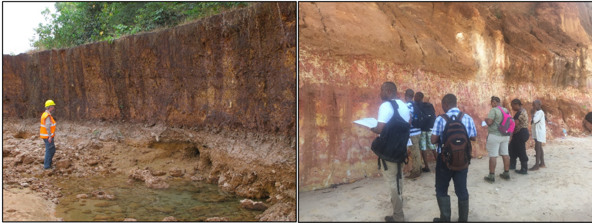
Figure 3: Studying exposures in the Bullom Group a) in the Sierra Rutile licence area and b) at Konakridie