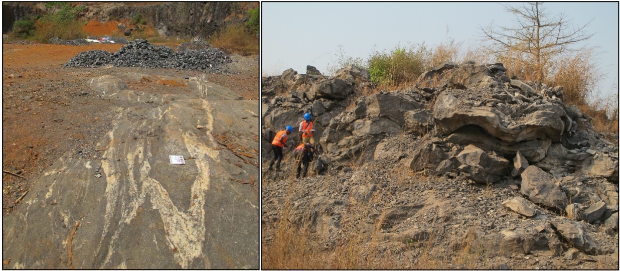
Figure 5: Examples of folding in a) the Kasila Group in the Ocara Hills and b) the Marampa Group at the Marampa Mine